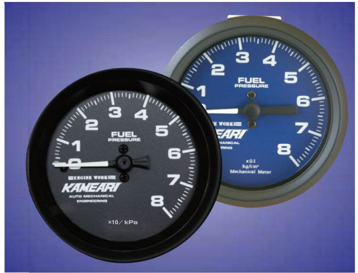
60φ Fuel pressure gauge (black & blue)

[Specifications] ¥13,000 (reinforced stainless steel mesh hose sold separately) Type: Mechanical Bourdon type Display range: 0 - 0.8 kg/cm 2 Face plate color: Black & dark blue Illumination: Blue Outer diameter: 60φ