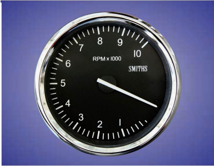
100φ Smith Classic Tachometer

[Specifications] ¥46,000 Type: Electric Display range: 0 - 10,000 rpm Face plate color: Black Illumination: Colorless Outer diameter: 100φ