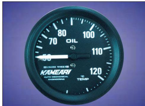
52φ Oil temperature gauge

[Specifications] ¥11,000 (Reinforced stainless steel mesh hose sold separately) Type: Mechanical Bourdon type Display range: 0 - 10kg/cm 2 Face plate color: Black Illumination: Blue Outer diameter: 52φ