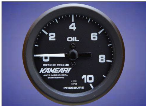
52φ Oil pressure gauge

part that is inserted into the middle of the fuel hose and connected to the reinforced stainless steel mesh hose.