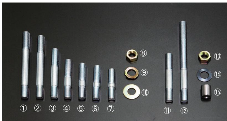
KAMEARI stud bolt details