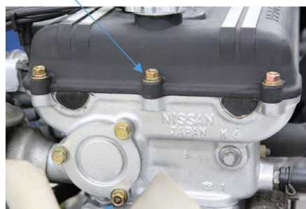
16.Disby gear cover bolt set of 3