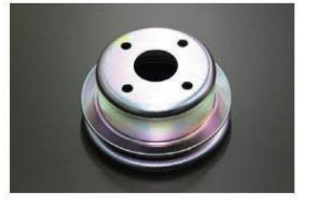
Genuine water pump pulley for L6

(Fuel Pump Hole Cover) Price: ¥1,070 (Updated 2025.4.9)