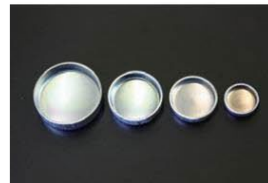
Cylinder block flanged plug