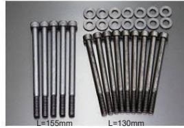
L-type Chromoly Head Bolt Set

Oil passage plugs required when installing a center-oil-feed cam.