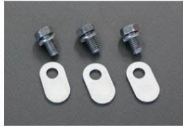
L6 Cam Holder Oil Shower Plug ¥1,200/SET

Oil passage plugs required when installing a center-oil-feed cam.