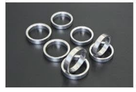
L18 STD Sintered seat ring SET

Compatible with: All L28 vehicles Valve size: IN:44ΦEX:35Φ Price: 24,000 (IN EX 1 set) *Oversized type designed to compensate for corrosion damage.