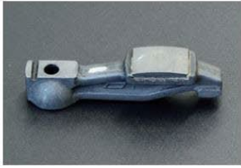
L-type Nissan genuine rocker arm