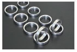
L20 STD Sintered seat ring SET

Compatible: L20 late model plastic tappet cover Price: ¥8,000