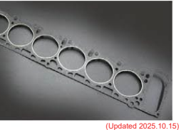
L20 STD head gasket

Aftermarket L20 Head Gasket ¥5,800 (Compatible cylinders: E30 and Y70) Nissan Genuine L20 Head Gasket: ¥18,400 (Compatible cylinders: E30 / Y70 / 14S)