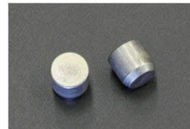
L-shaped oil gallery plug (2 pieces used at the front and rear of the cylinder block)