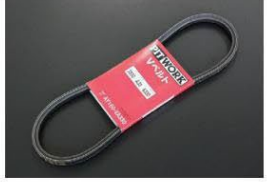
L-shaped fan belt (standard)