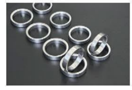
L28 STD Sintered seat ring SET

Compatible with: L24 (240Z) Valve size: IN:42ΦEX:33Φ Price: 24,000 (IN EX 1 set) *Oversized type designed to compensate for corrosion damage.