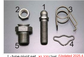
L-type pivot set ¥1,320/1set (Updated 2025.4.9)

Price: Discontinued (Updated 2026.02.08)