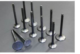
L24 Standard Valve

Compatible: L24(L26 (E88) Size: IN:42Φ EX:33Φ Price: ¥3,000/each ¥36,000/each