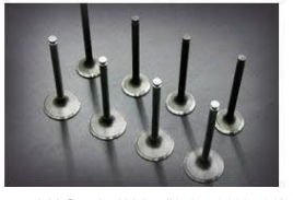
L28 Standard Valve (Updated 2025.4.9)

Compatible: L24(L26 (E88) Size: IN:42Φ EX:33Φ Price: ¥3,000/each ¥36,000/each