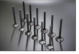
L20 Standard Valve

Compatible: L28 (N42) Size: IN: 44ΦEX: 35Φ Price: IN ¥2,310/each EX ¥3,250/each