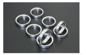
L14 STD Sintered seat ring SET

Compatible with: L18, L20B Valve size: IN:42ΦEX:35Φ Price: ¥16,000 (IN EX 1 set) *Oversized type designed to compensate for corrosion damage.