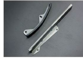
L-shaped chain guide (Updated 2025.10.30)

Applicable to: All L-type vehicles *Strong washers included Price: ¥10,000/L6 set ¥7,200/L4 set *Wrench size: Please use a hex wrench M8