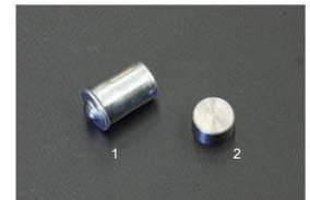
L-type Oil Relief Valve & Plug (Updated 2025.4.9)