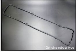
L6 Plastic Tappet Cover Rubber Gasket

Fits: L16, L14 Vehicle: 510, etc. Price: ¥4,950 (aftermarket)