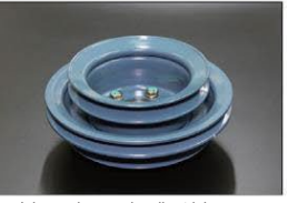
L4 genuine crank pulley triple pulley type (3rd stage can be removed)

L-type oil thrower (image on the right) ¥110