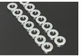
L-type genuine head bolt washer set

Price: Discontinued (Updated 2026.02.08)