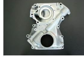
L-shaped front cover (Updated 2025.4.9)

*For manual transmission vehicles up to S52. ¥1,930