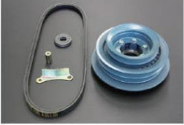
L6 Cooler Pulley Kit (Updated 2025.4.9) ¥21,880/KIT

A type that is 1.3 mm shorter in height than the genuine part. It increases the clearance before bottoming out, allowing for greater valve lift.