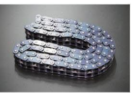
Genuine Nissan Timing Chain

Compatible with: L14 Twin carb Valve size: IN:42ΦEX:33Φ Price: ¥16,000 (IN EX 1 set) *Oversized type designed to compensate for corrosion damage.