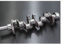
L16 modified L18 78mm crank (updated 2025.4.9)