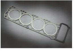
L16.L14 STD head gasket

Fits: L18 Vehicle: 510, etc. Price: ¥4,950 (aftermarket)