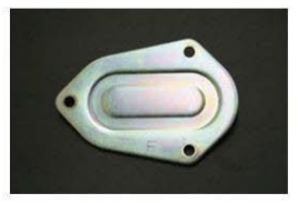
Genuine L-type head front cover

Compatible with: All L-type vehicles Price: L6 ¥3,080 L4 ¥2,200