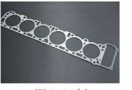
STD head gasket

with: L20-L28 L14-L18 Specifications: inner and outer diameter STD (inner diameter fine adjustment required) Price: L6 ¥14,400/SET L4 ¥9,800/SET