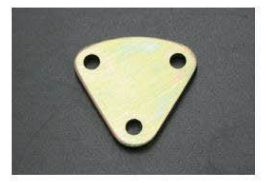
Genuine L-shaped head triangular cover