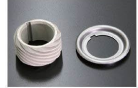
L-type oil pump gear (image on the left) (Updated 2025.4.9) ¥2,860

*2 water pump knock pins included ¥9,560