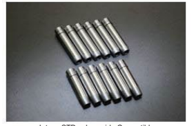
L-type STD valve guide Compatible

Compatible: L20 Size: IN: 38ΦEX: 33Φ Price: IN ¥3,000/each EX ¥3,000/each